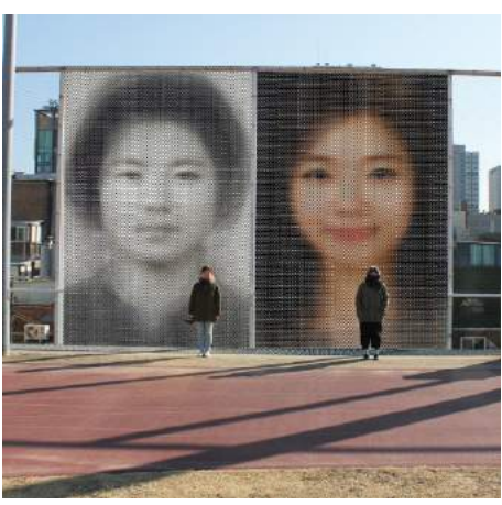
Face collage from 130 photos of Ewha students in the 20th century (left) and 21st century (right)

'ARTFESTA EWHA,' consisted of 5 projects: Ewha Craft&Art Fair, Design 52, Pop-up Containter Project, Public Art Project, Ewha Media Art Presentation. During Artfesta Ewha, the entire campus was packed with media art exhibitions under the themes of art and history, art and technology, and art and nature.